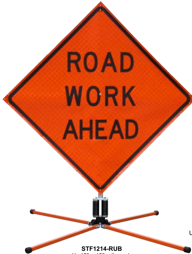
STF1214-RUB with 48" x 48" roll-up sign