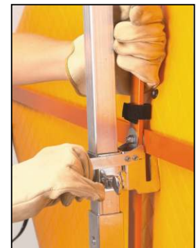
Roll-up sign bracket