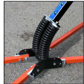
STF1214-RUB Uses the TwinFlex™ dual heavy duty spring system for wind relief