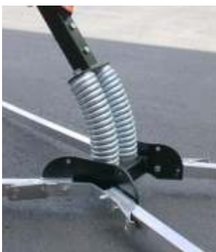
TwinFlex™ Spring System