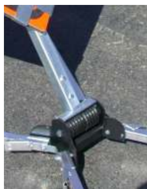
DynaFlex™ Spring System