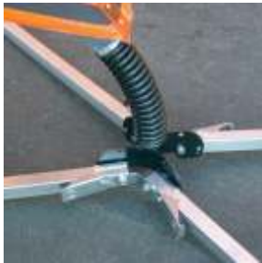
UF2000 Spring System