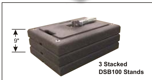
3 Stacked DSB100 Stands