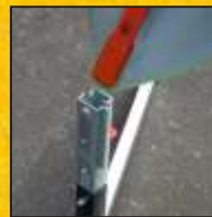
Latch Style Sign Holder