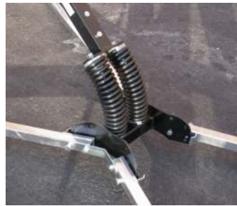
TwinFlex™ Spring System

Spring Stands for Roll-Up and Rigid Signs