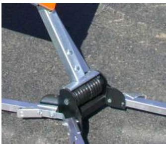
DynaFlex™ Spring System