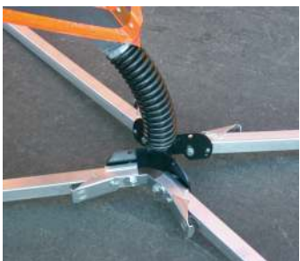
UniFlex™ Spring System