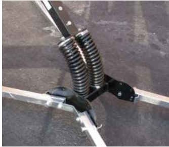
TwinFlex™ Spring System

Spring Stands for Roll-Up and Rigid Signs