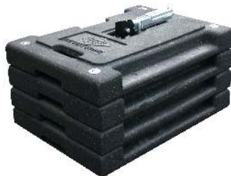
Stack of 4 DSB100 stands is only 12" tall!