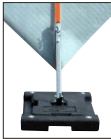
DSB100-W with ScrewLock sign holder