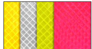
Other reflective Super Bright™ sign colors: Yellow, White, Lime, Pink