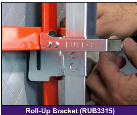
Roll-Up Bracket (RUB3315)

Most signs may have velcro added to specific words that allows for multiple messages to be displayed using a single roll-up sign. Overlays are made from the same material as the sign and come with velcro strips on the back. Snap attachment is also available on request.