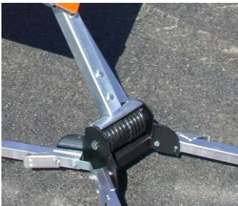
DynaFlex™ Spring System