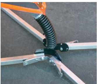
UniFlex™ Spring System