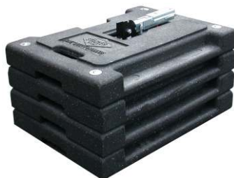
Stack of 4 DSB100 stands is only 12" tall!