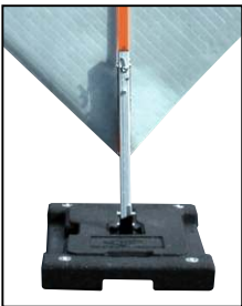
DSB100-W with ScrewLock sign holder