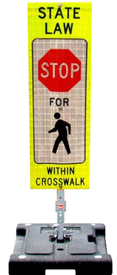
DSB100 Stacker Stand