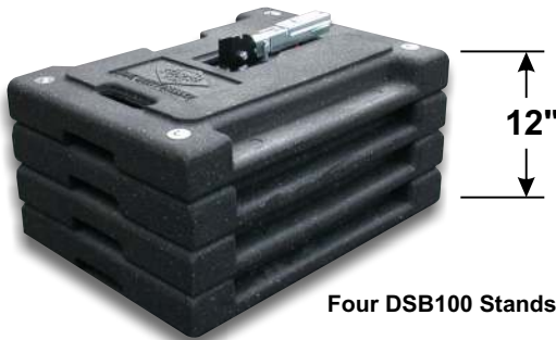
Four DSB100 Stands