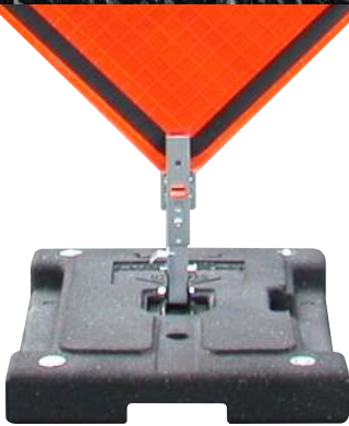
DSB100 with Roll-Up Sign