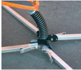
UF2000 Spring System