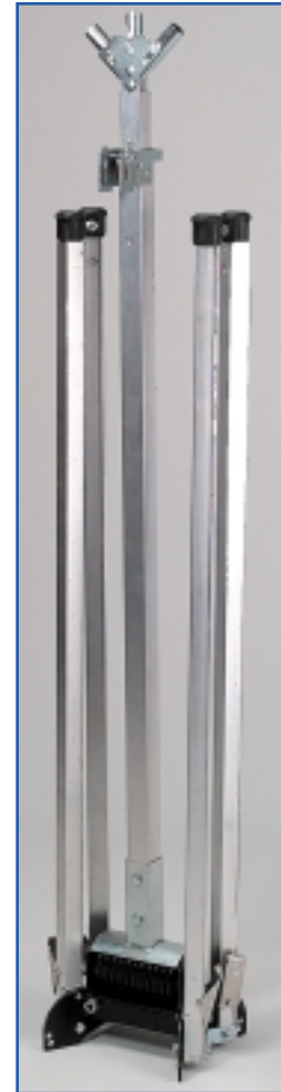
Storage height: 60" (1524 mm) Weight: 37 lbs.