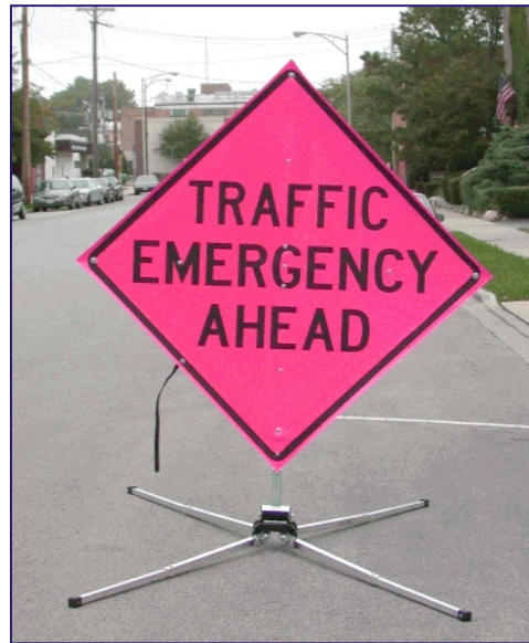
Shown here: DF3003S sign stand and 3000XP48 sign panel

Emergency personnel face not only the hazard at the situation they are attempting to suppress but they are also facing dangers related to motorists driving through or near an emergency scene. Advanced warning signs alert motorists of hazardous conditions ahead and create a higher level of awareness. Proper training in the use and deployment of signage is essential.