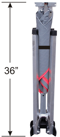
36" Sign System