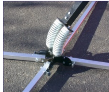
Heavy duty spring system flexes for stability in windy conditions.