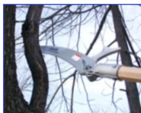
#812A Saw Head