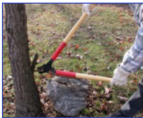
#7989 Pruning Shears