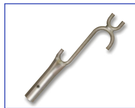
#815 Wire Raising Tool