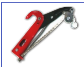
#801 Cutter Head