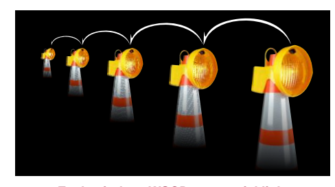
Each wireless WSCD sequential light instantly senses its position in the sequence and sets itself automatically!

Mono-Directional Amber Lens Mono-Directional Blue Lens Mono-Directional Red Lens